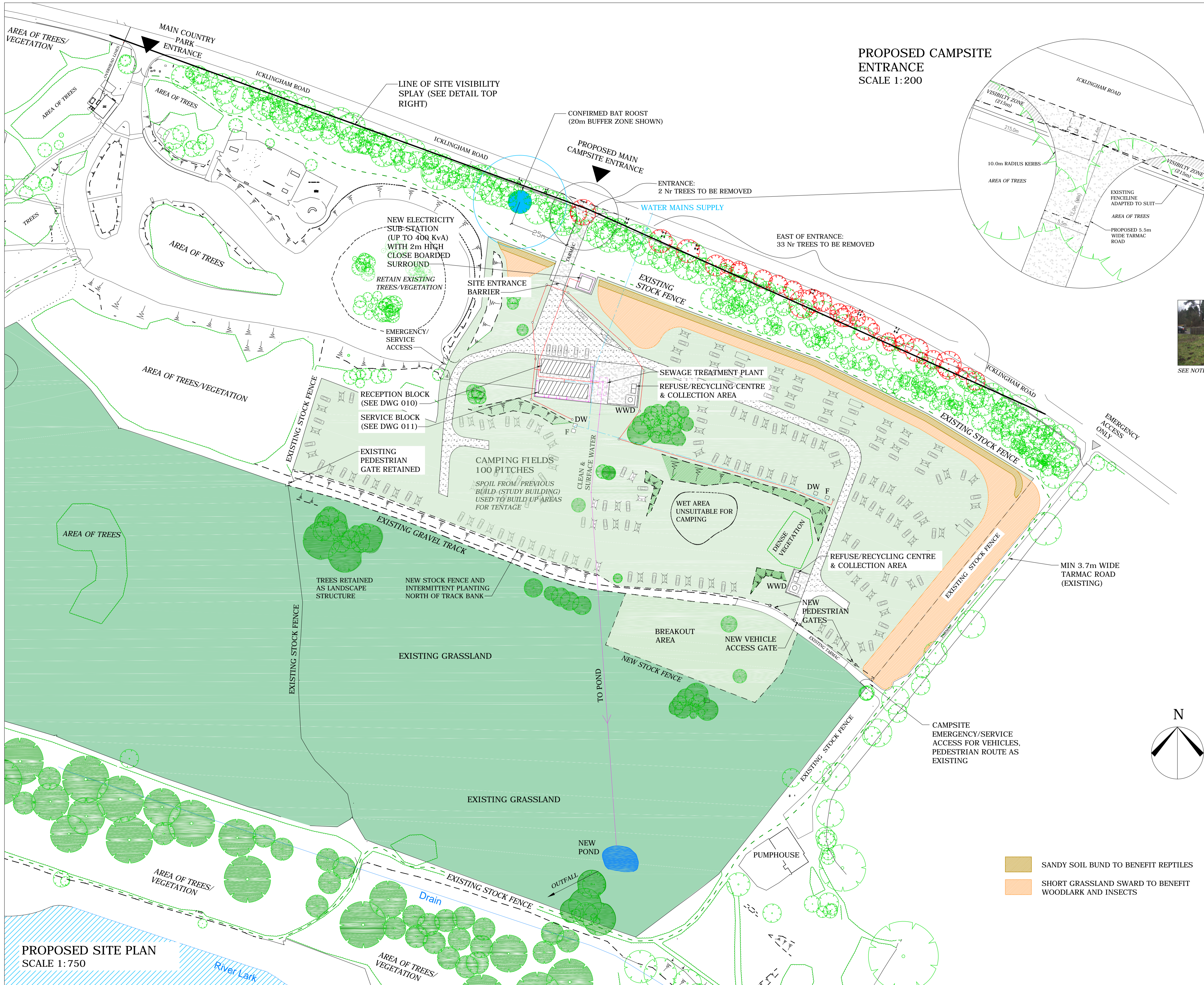
PROPOSED CAMPSITE ENTRANCE SCALE 1:200